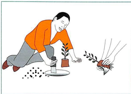
Figure 2: Planting seedling in field

Start planting immediately the rainy season begins. The ideal planting season in the eastern drylands is during October – December rains. To test if the soil has enough moisture, dig up some soil from the lower horizons of the planting pit after a few days of continuous rain but on a non-rainy day. Then squeeze this soil in your hand. If the soil particles form a muddy wet bond then this is the ideal planting time. However, if the soil particles disintegrate on release, you must wait for more rainfall. You should plant on a cloudy day.