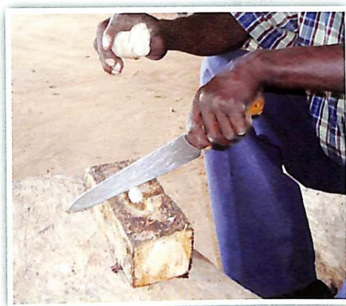
Plate 2: Melia volkensii nut cracking methods: (a) Using a plank wood

Note: One nut contains 1-5 seeds and on average there are 200 seeds per kilogramme of nuts.