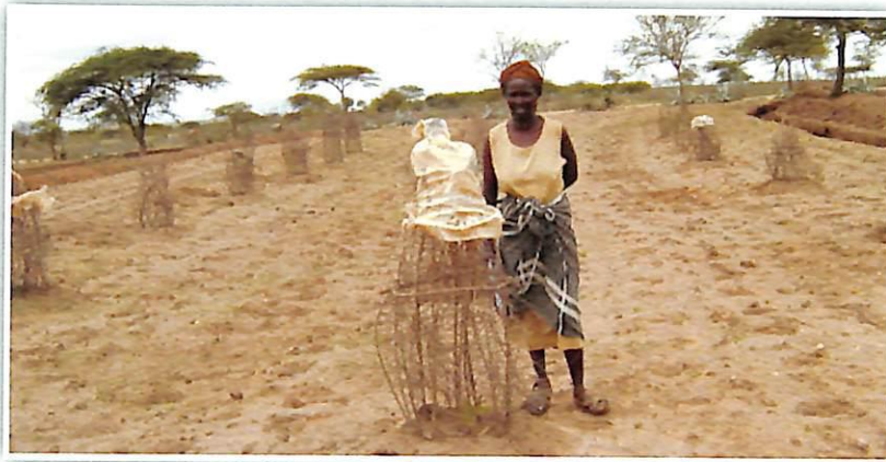
Plate 7: Young Melia seedlings protected from browsers

The major problem experienced in growing Melia is the browsing of young trees by domestic and wild animals such as dik-diks. To get quality timber, the planted trees should be fully protected from browsers for at least 1–2 years after they take root (Plate 7). However, livestock may graze the field if the trees are adequately protected from domestic animals such as donkeys which at times debark the trees.