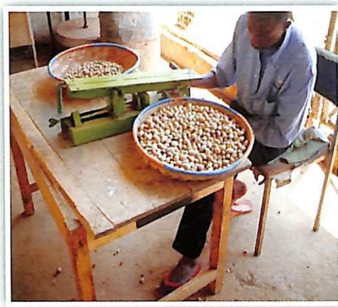
(b) Using a nut cracker