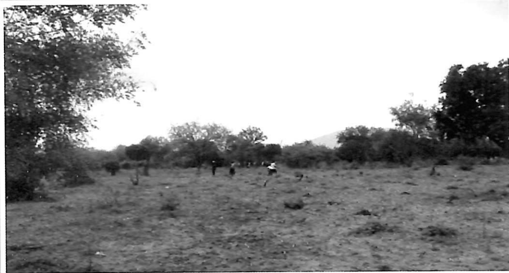
Plate 5: Melia site ready for planting. Notice valuable trees are left in the field (background).

Select the site for planting Melia well in advance, usually a few months before the onset of the rains. Melia does well in sandy or loamy soils with good drainage. It is sensitive to flooding and does not do well in black cotton soils. If planting on slopes, you need to construct soil conservation structures. Cultivate your land to improve water infiltration, but leave existing valuable tree species in the field (Plate 5).