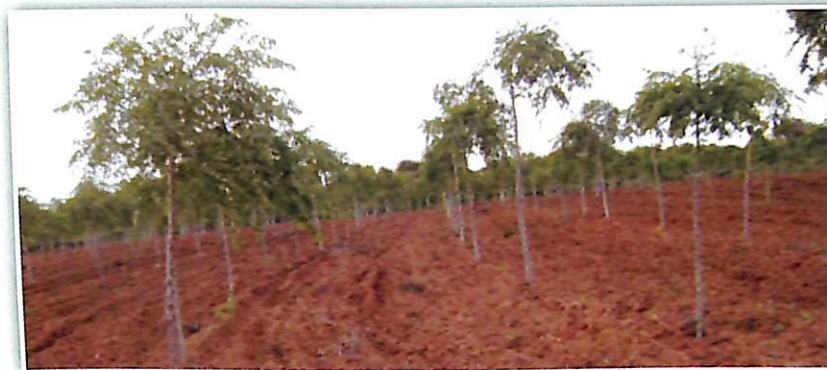
Plate 6: Completely weeded Melia plot

For young Melia trees to survive and grow, you must ensure complete weed control. Two or three weeding per season is recommended within the first three years after the tree has taken root (Plate 6).