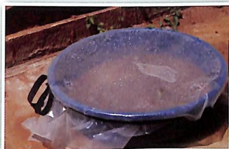
(b) Plastic basin covered with polyethylene