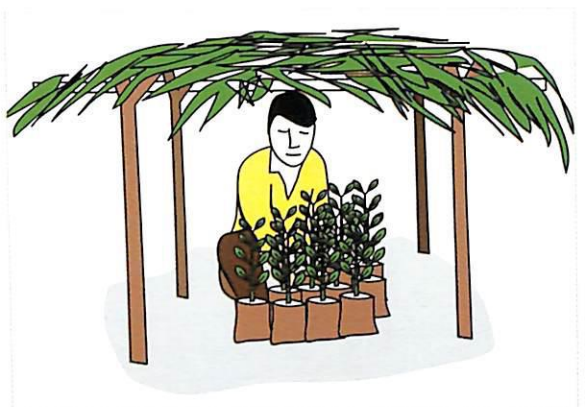
Figure 1: Seedlings under shade

Keep the pricked out seedlings and potted wildlings under moderate shade (50-70%) for two weeks before transferring to an open nursery area (Figure 1). Melia seedlings are sensitive to water logging, and so it is important to control watering. Over-watering pre-disposes the seedlings to fungal attack ( Fusarium spp.) causing damping-off disease. Seedlings are therefore watered once in two days or when the potting soil is dry.