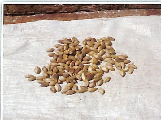
(b) Nuts dried in the shade