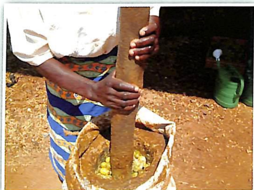
Plate 1: (a) De-pulping using mortar and pestle

Wash the nuts obtained and dry them under shade for at least one day (Plate 1b).