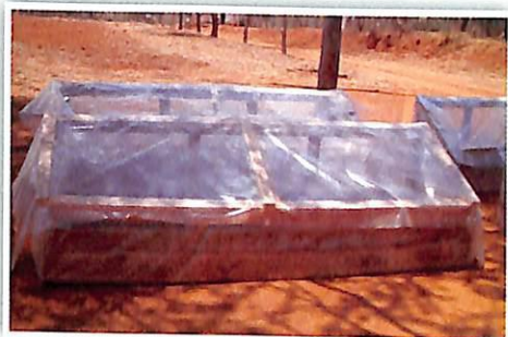
Plate 3: Different sowing chambers: (a) Non-mist propagator

Avoid damaging the seed cotyledon and the embryo during nipping and slitting. Sow the seeds in a non-mist propagator (Plate 3a) in a germination medium of river sand sterilized by using 6% sodium hypo-chlorite solution such as JIK™. You can also improvise the non-mist propagator by using plastic basins covered with polyethylene sheet and tightly wrapped with rubber band (Plate 3b). Some farmers also use a bed of sand supported by clay bricks and covered with polyethylene.