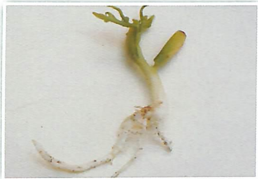
Plate 4: Seedlings pricked out: (a) 3 days after germination

Germination takes place after 3-6 days. The recommended pricking out time is 1-3 days after germination (Plate 4). Late pricking out results in higher shock to the seedlings and hence higher mortality of the germinants. After pricking out seedlings, remove the seed coat to reduce fungal attack to the seedlings. Transplant the pricked out seedlings into appropriate potting material filled with potting media composed of soil, sand and manure in the ratio 4:1:1.