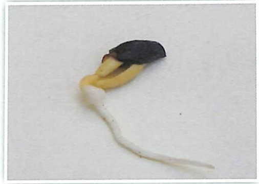
(b) 5 days after germination